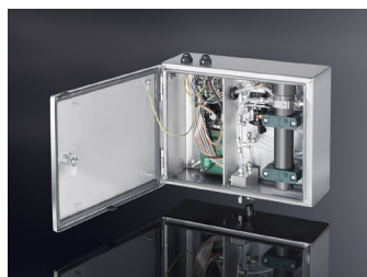
PAMAS OLS50P in stainless steel shell

For Phosphate-Ester based hydraulic liquids (e.g. aviation hydraulic fluids), the PAMAS OLS50P is manufactured with a special stainless steel shell that protects the housing from corrosive liquids.