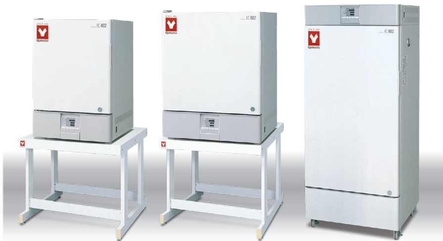
97L IC402+ON61 (Option)

* Please specify when ordering main unit.