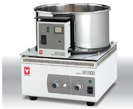
BO500 + MB800 (Magnetic Stirrer)