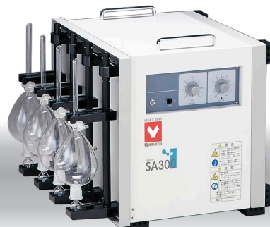
SA300 with separating funnel holder