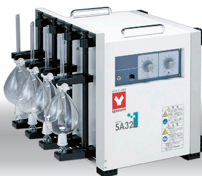
SA320 with separating funnel holder