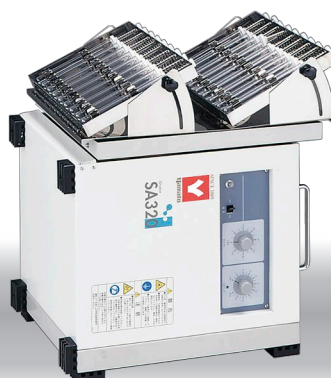
SA320 with test tube holder