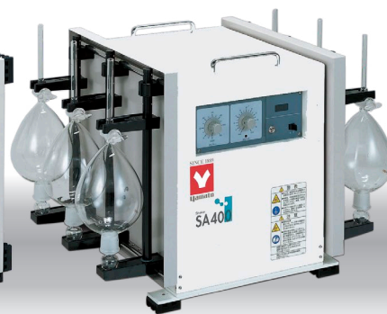
SA400 with separating funnel holder