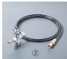
Water Supply Unit (OWH10)